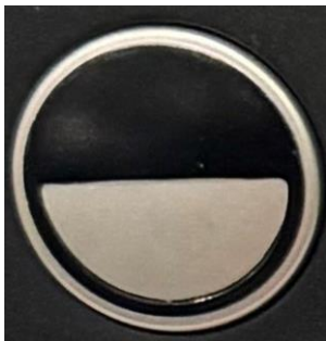
High Contrast (Greyscale)