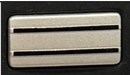
Line and Blinds